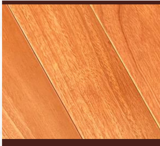
reacton mahogany equaliser