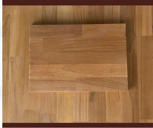
reacton teak equaliser